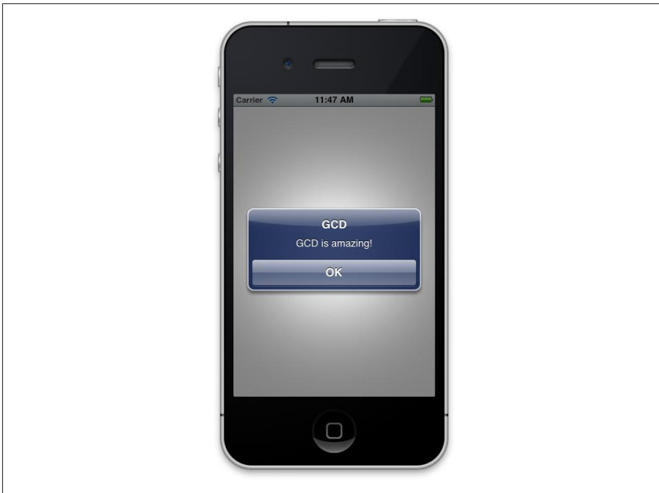
Figure 2-1. An alert displayed using asynchronous GCD calls

This might not be that impressive. In fact, it is not impressive at all if you think about it. So what makes the main queue truly interesting? The answer is simple: when you are getting the maximum performance from GCD to do some heavy calculation on concurrent or serial threads, you might want to display the results to your user or move a component on the screen. For that, you must use the main queue, because it is UI-related work. The functions shown in this section are the only way to get out of a serial or a concurrent queue while still utilizing GCD to update your UI, so you can imagine how important it is.