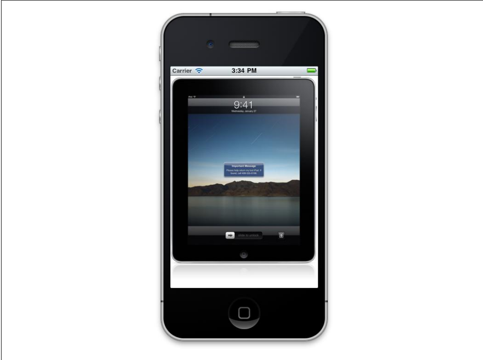
Figure 2-2. Downloading and displaying images to users, using GCD

As you can see in Figure 2-2 , we have successfully downloaded our image and also created an image view to display the image to the user on the UI.